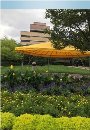
View of the Hospital Courtyard with UH-South in the background