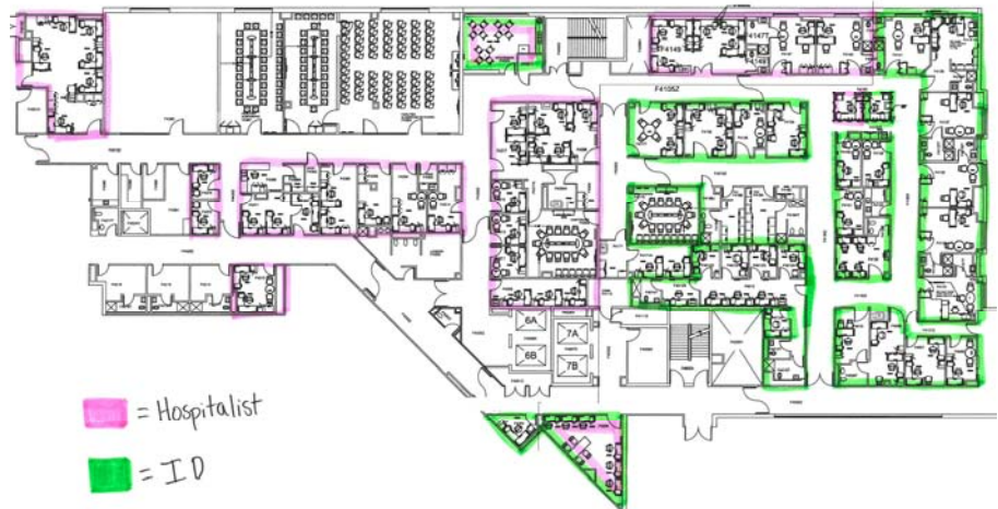
Map showing hospital medicine space in UH-South (highlighted in pink)

Hospital Medicine Move Contact: Summer Schaible summermo@umich.edu 734.647.6928