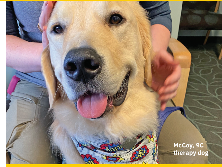
McCoy, 9C therapy dog