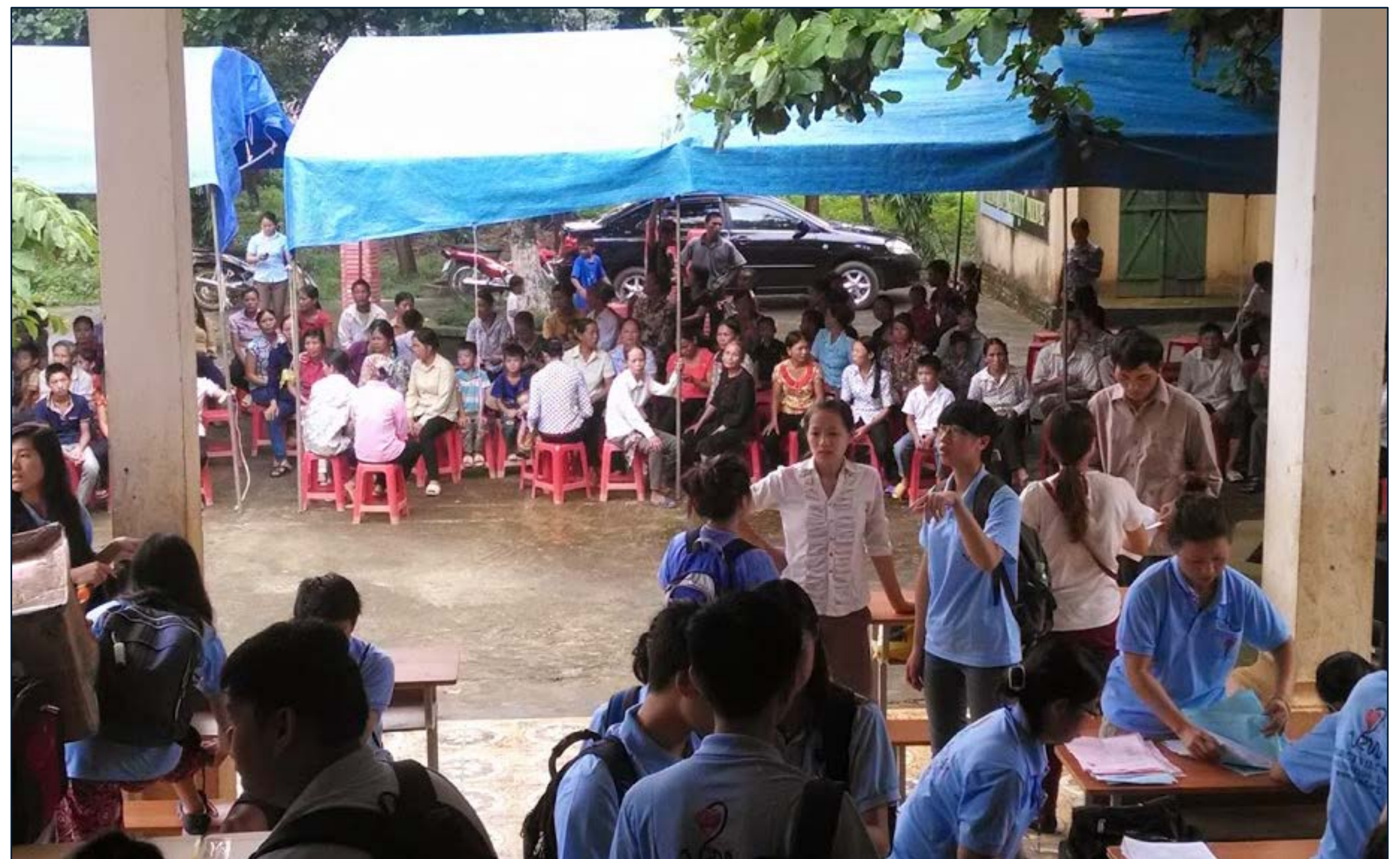
Local volunteers register villagers. The patients wait and wait -- sometimes for hours -- before being seen.