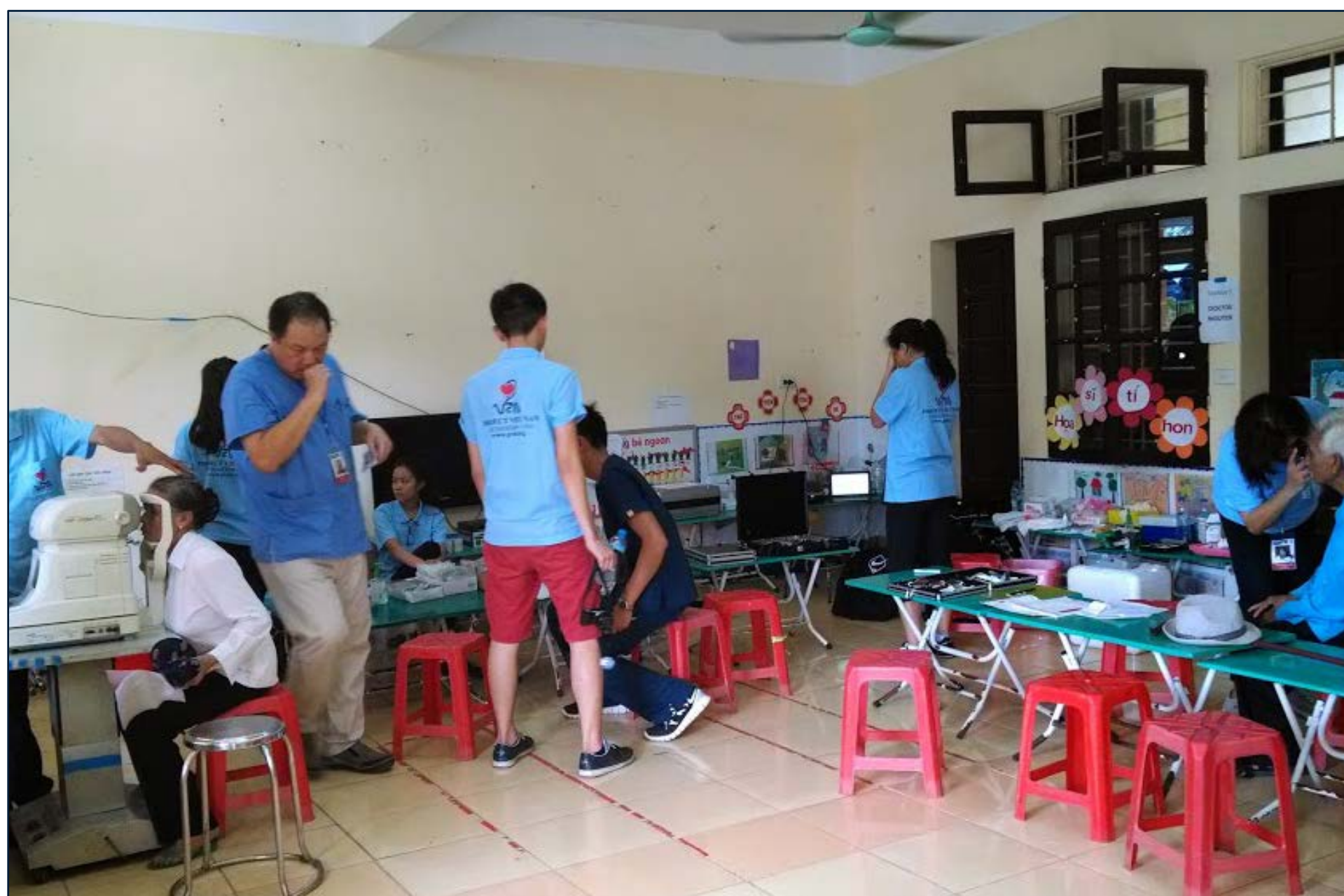
Doctors and students set up the optometry room. Minimal equipment is available and charging of instruments is difficult due to inconsistent power.