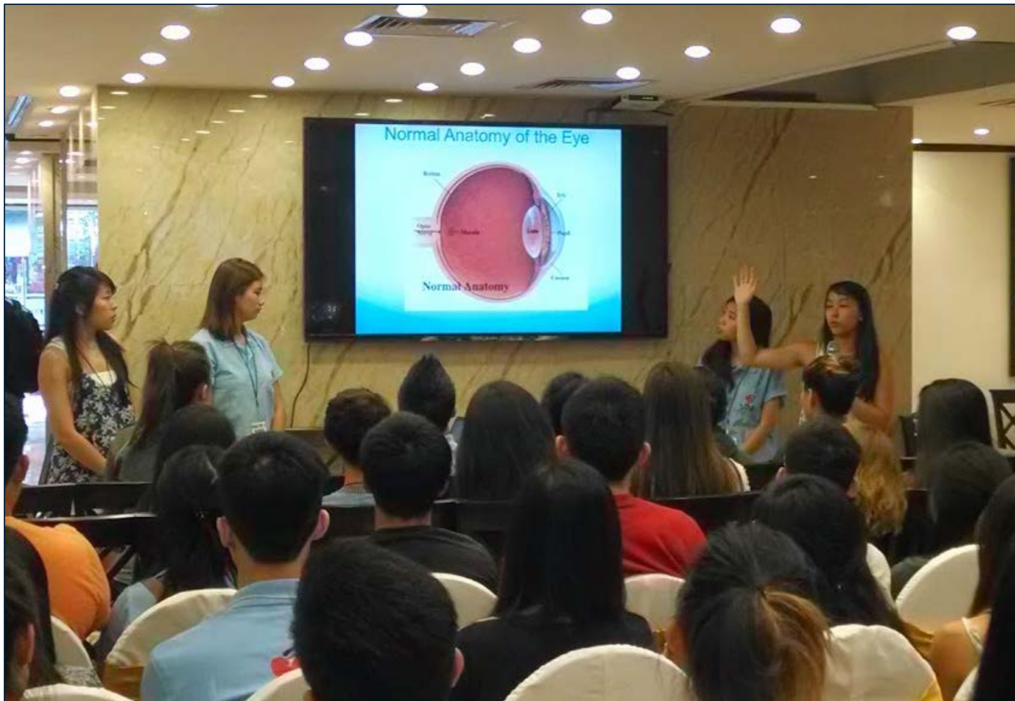
Optometry students give a presentation to the undergraduate volunteers on refractive error and ocular health. This presentation helps the volunteers preview what will happen in the clinics.