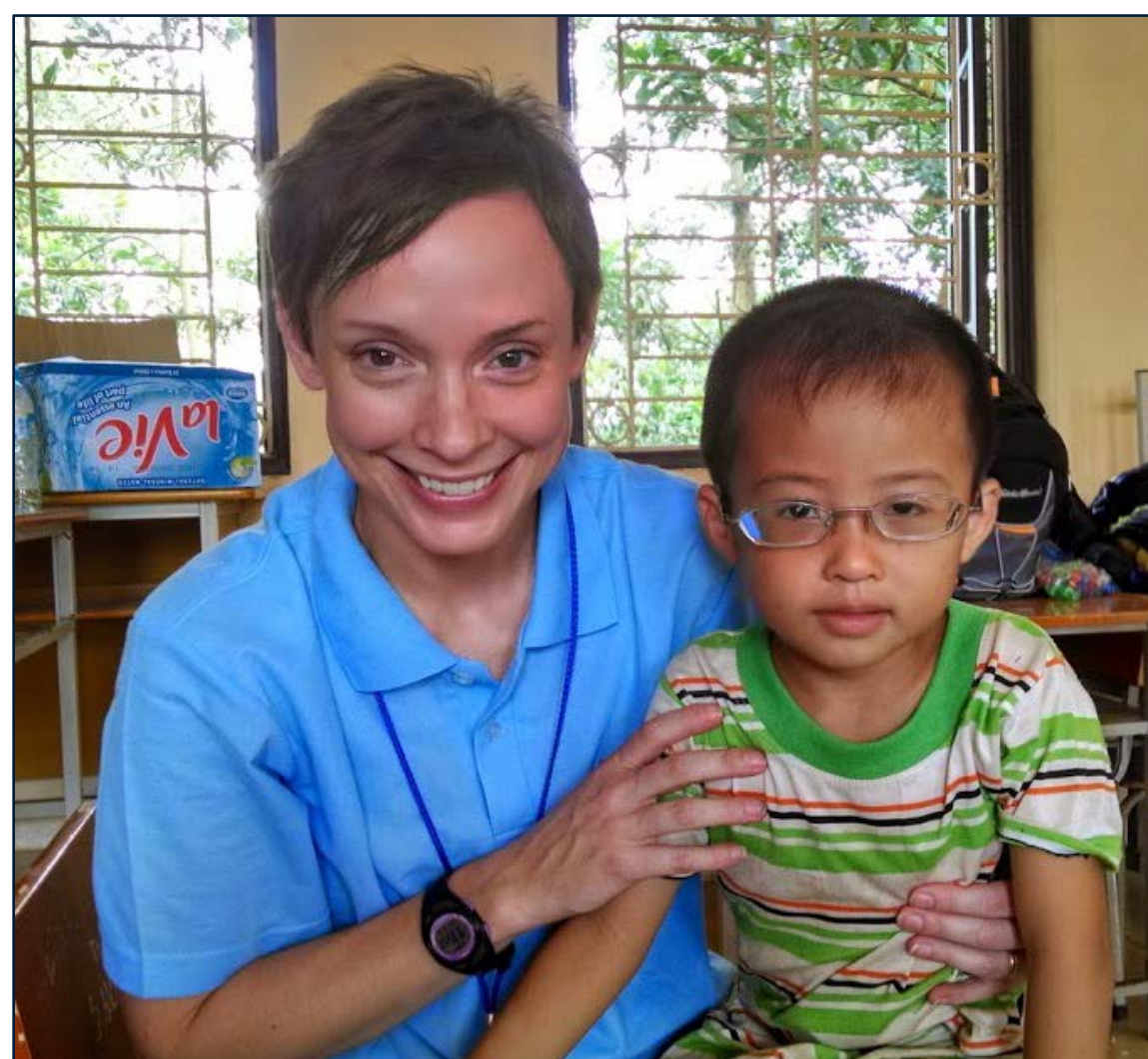
Uncorrected refractive error is the world's leading cause of visual impairment.