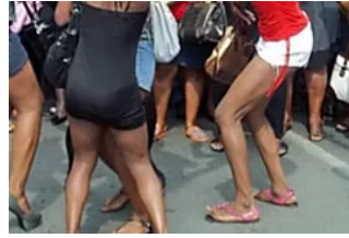
This is how Nigerian sex workers are 'upgrading' university students