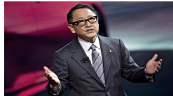
Toyota: A giant that wants to act small