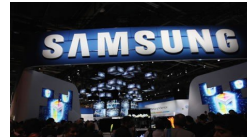
Samsung teases camera improvements for Galaxy S9