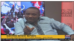
NPP eyes South Africa ANC victory margins in 2020 elections