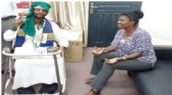
Man who claims to have found cure for HIV get schooled on mode of