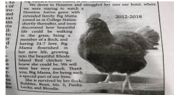
Texas paper prints obituary for beloved pet chicken