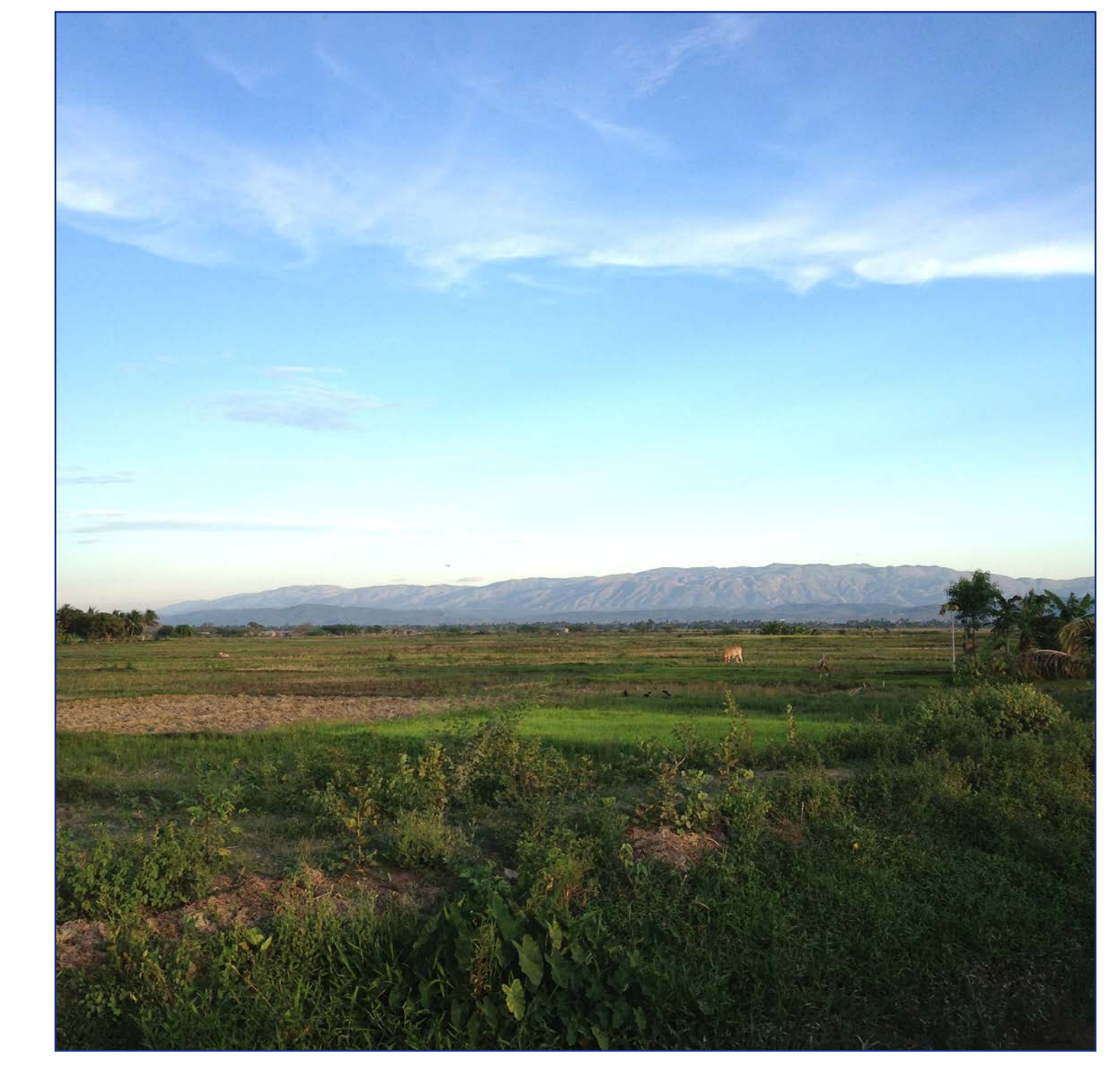
View of the lower Artibonite Valley