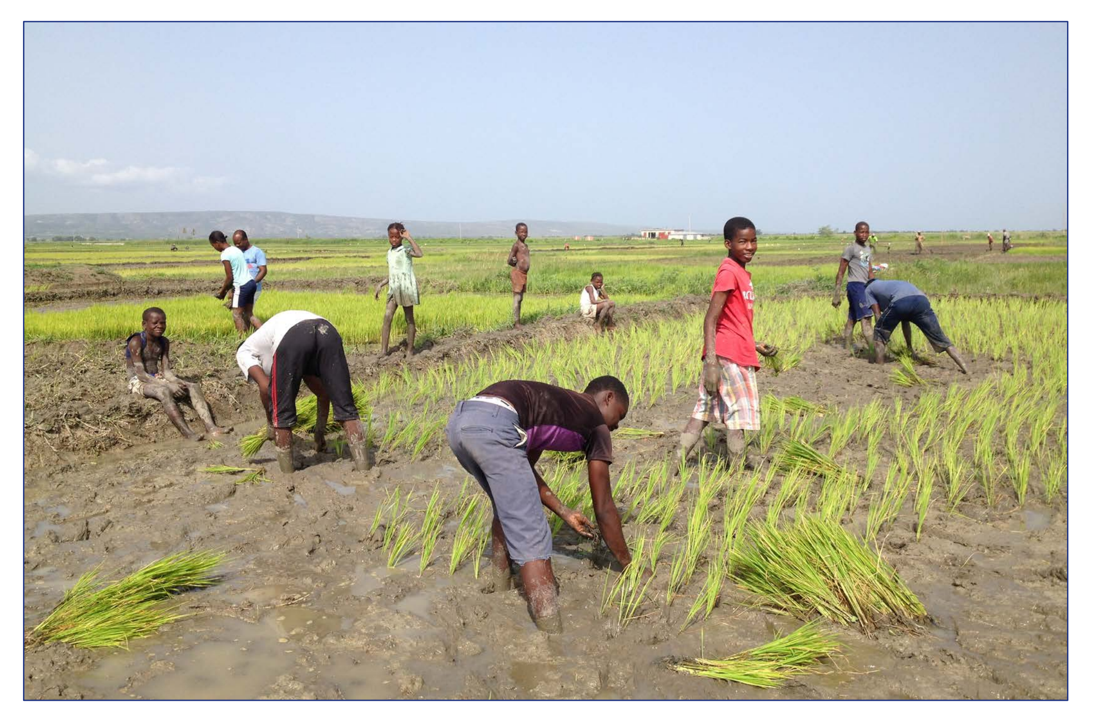
Young men and children re-planting rice shoots