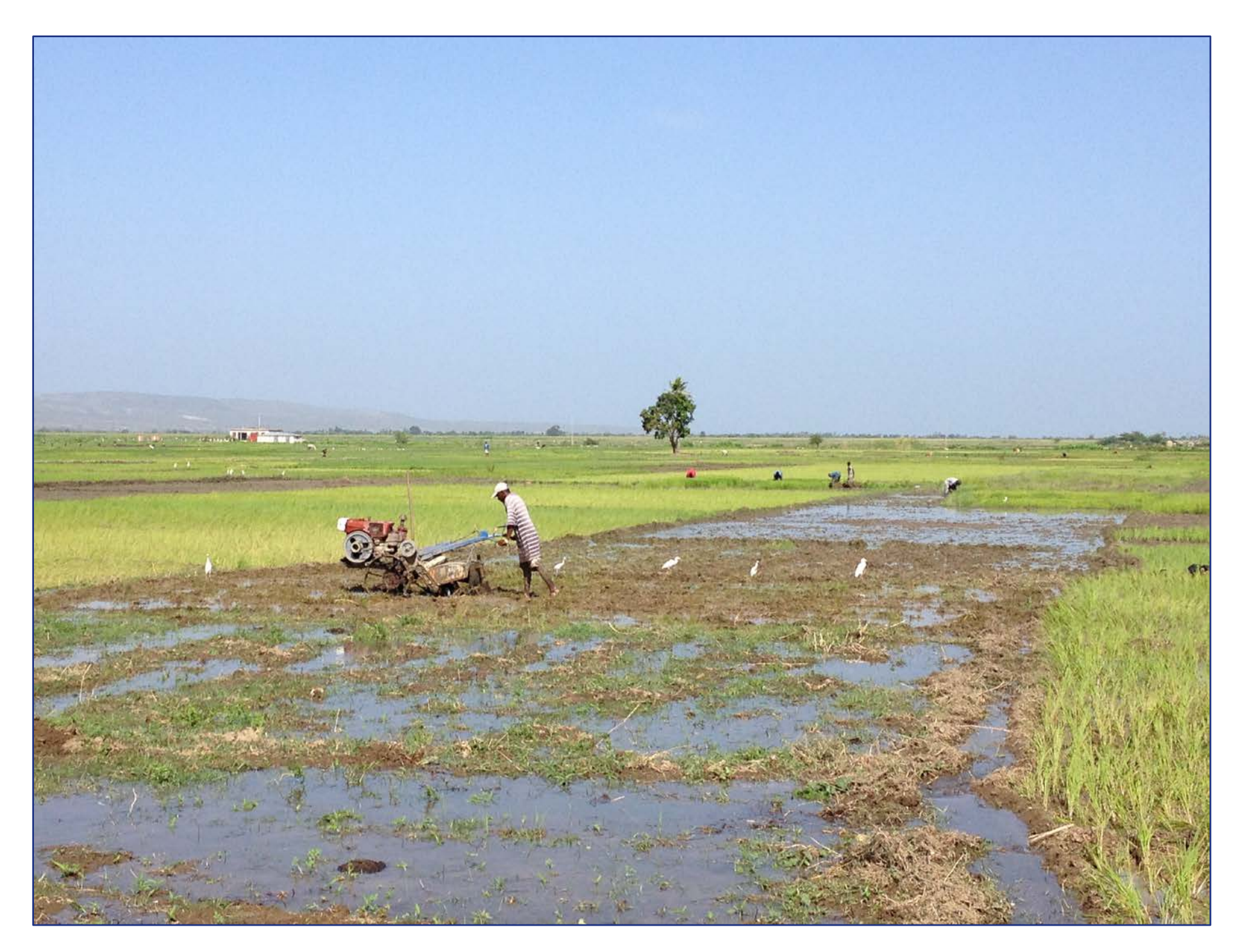
One of few diesel-powered plows available to prepare land