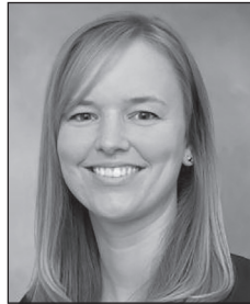
Anna Faris