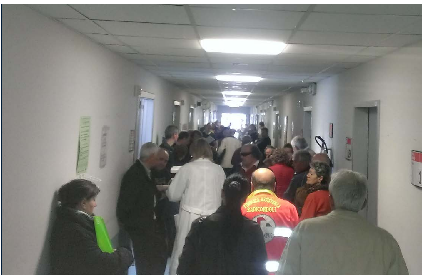
The ophthalmology "waiting room" at the University of Siena. There is jockeying for position in the waiting line.