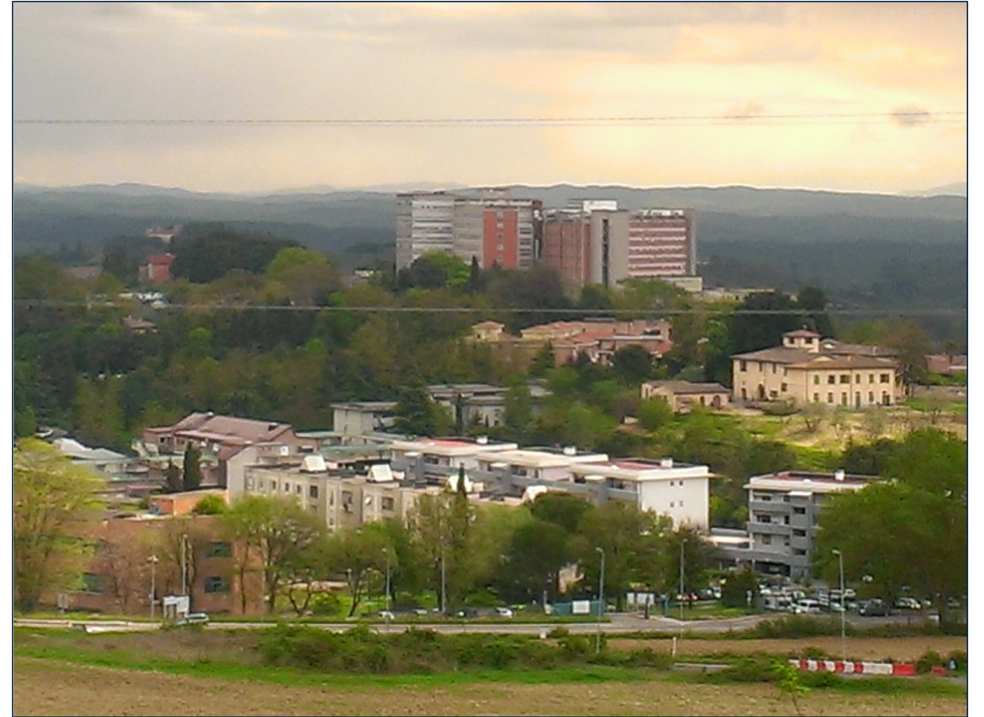
The University of Siena Hospital