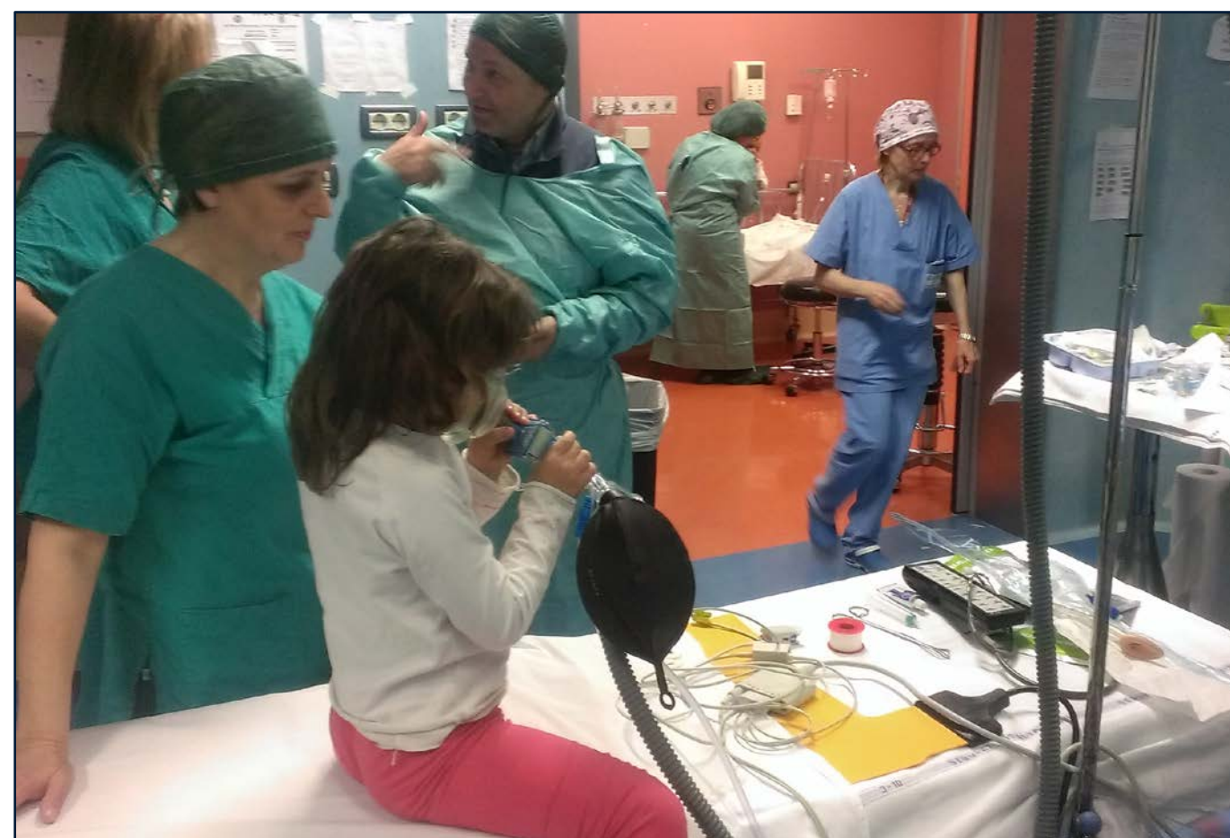
An older child puts herself to sleep prior to an exam under anesthesia.