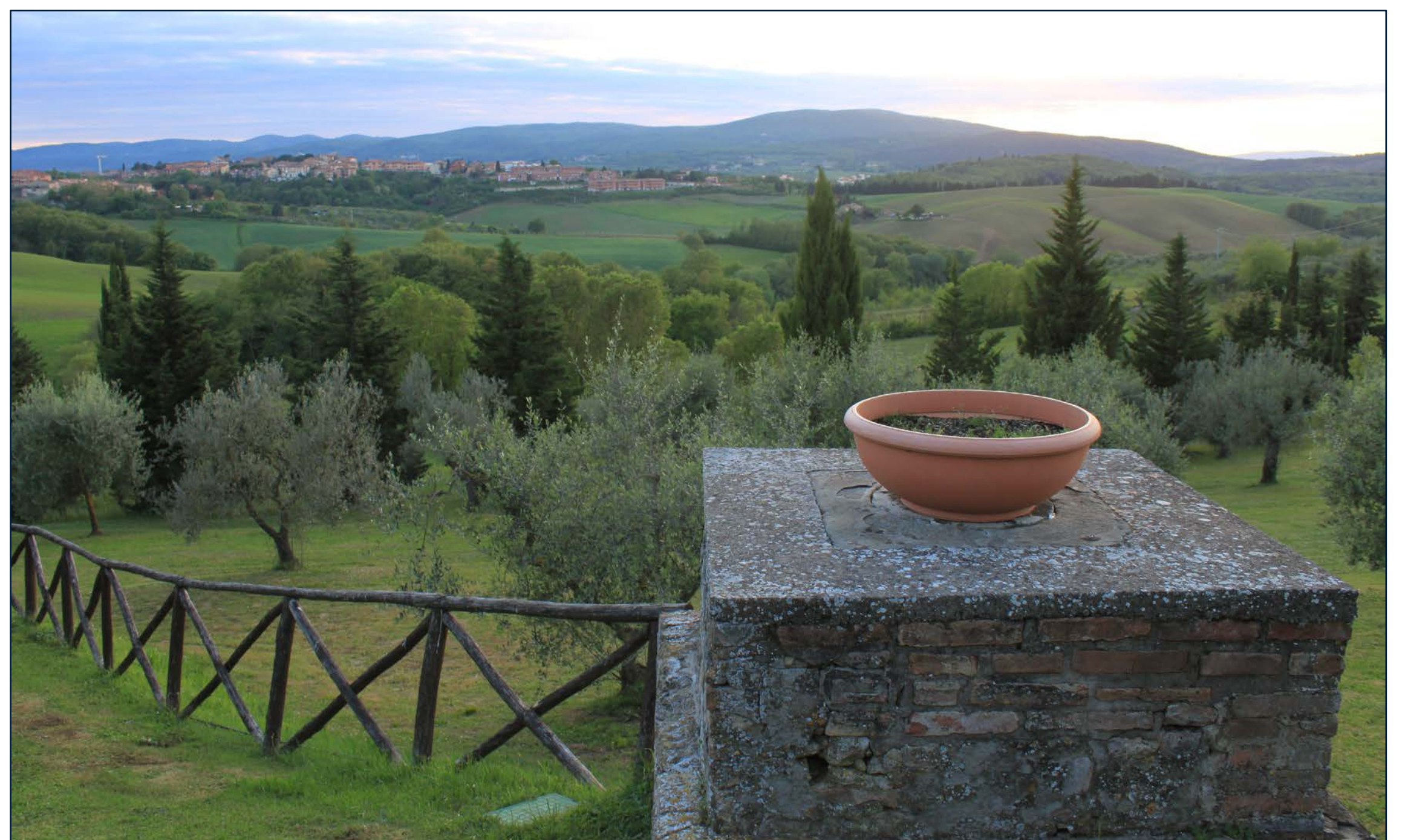
View of the Tuscan countryside along the bike path from hotel to the hospital.