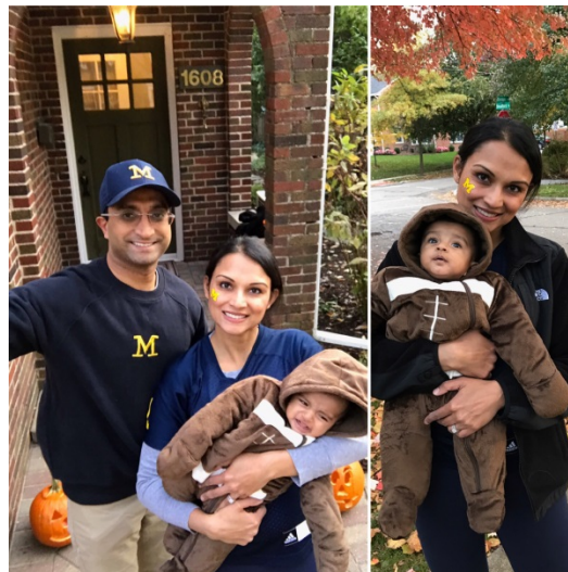
Dressed up as Michigan football for Halloween, Go Blue! (We wanted to make sure we were accepted by our neighbors...)