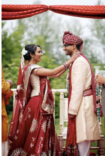
Sealing the deal with a garland!