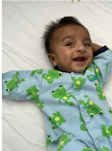
Rishi at 3 months

Finally, I contribute 1.0 FTE gender along with Asian diversity.