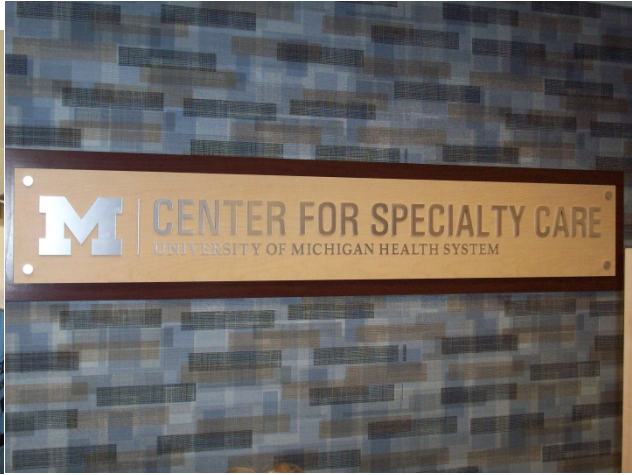
(Left) New exam area, (Right) LCSC sign above check out