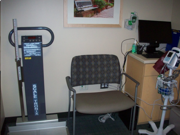
(Left) Old intake area, (Right) New intake area