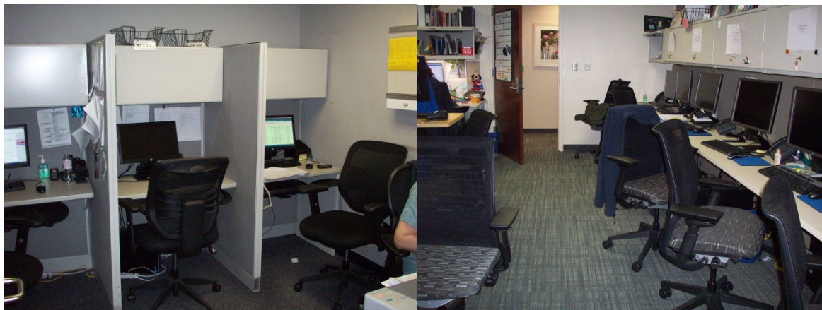
(Left) Old Urology Dictation Room, (Right) New Urology Dictation Room