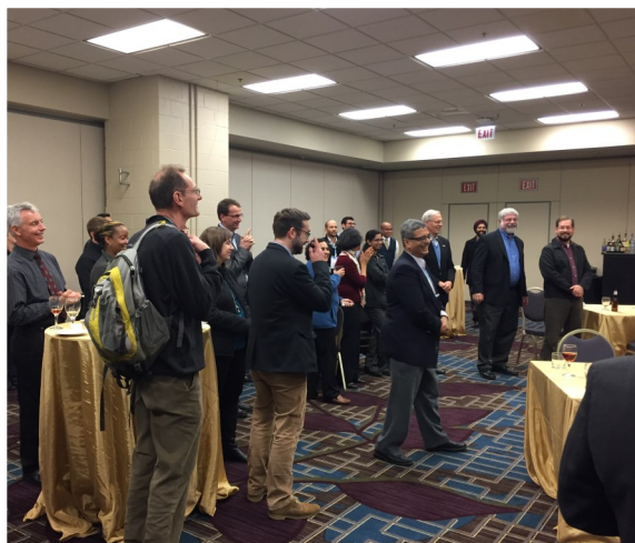
2016 Annual Weller Society Meeting / ASN Kidney Week Reception